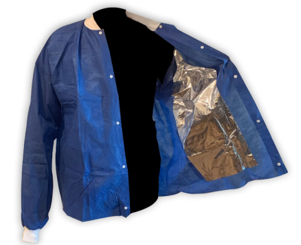
Thermal Warming Jacket