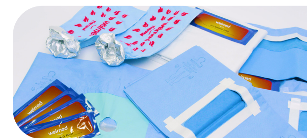
Thermal Warming Products