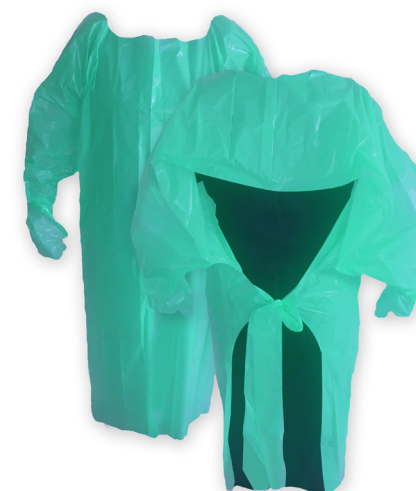
GoGreen Isolation Gown