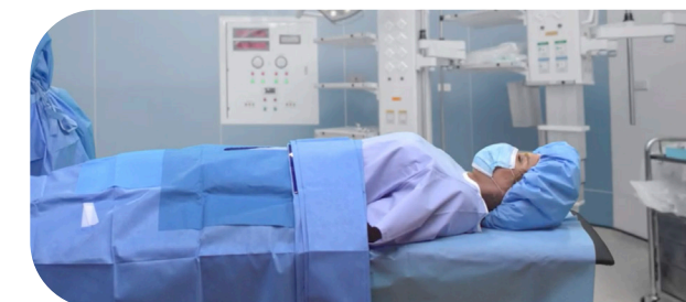
Warming Surgical Drape with Thermal Bouffant